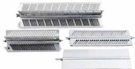
Example of product design