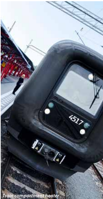
Train compartment heater