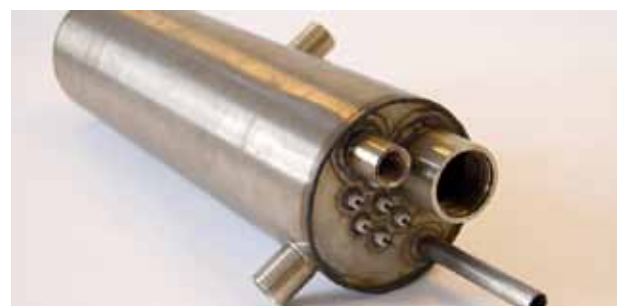
Example of product design