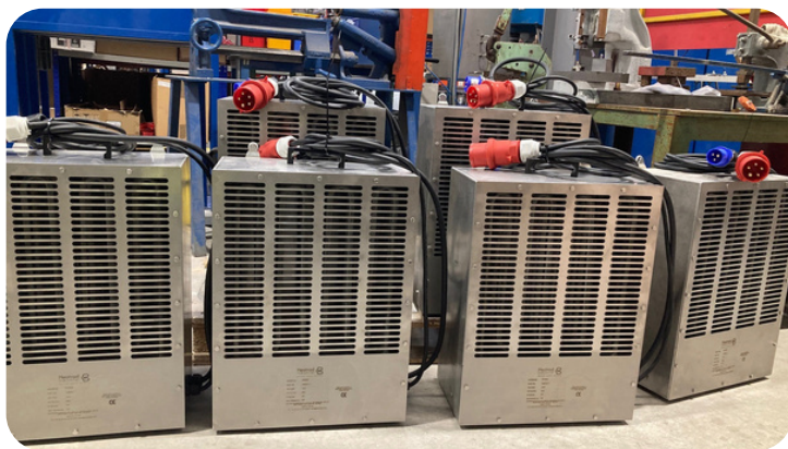
Portable Radiant Heaters