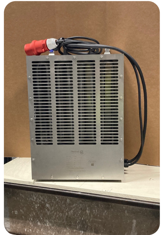
9kW Radiant Heater