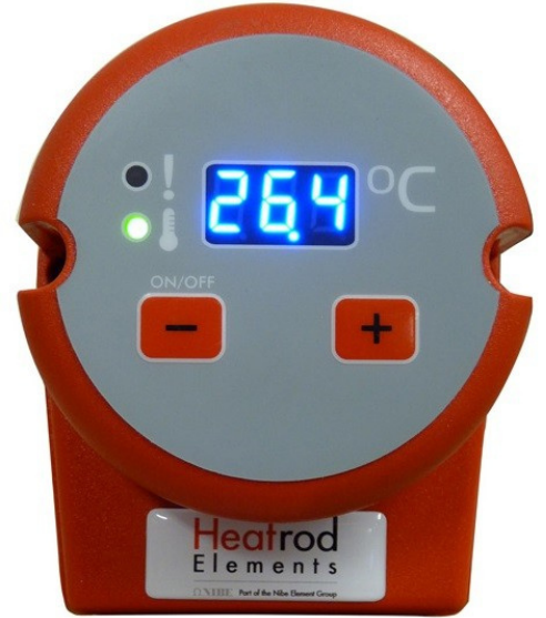
HRD Digital Immersion Heater

The HRD range is designed to be heavy duty with flexibility in mind, for easy installation into multiple industrial liquid heating applications. The terminal box is proven for ease of wiring and flexible for access in all types of locations. The digital controller can be programmed and wired for both single or three phase operation. Along with the standard Incoloy sheath, we also manufacture using different levels of element sheath protection depending on the environment which the heater is being installed into.