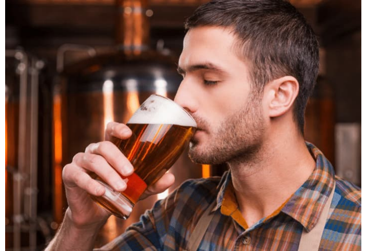
Application - Brewing