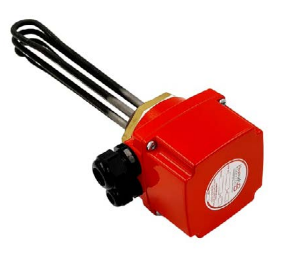
HRZi Heavy Duty Industrial Titanium Immersion Heater