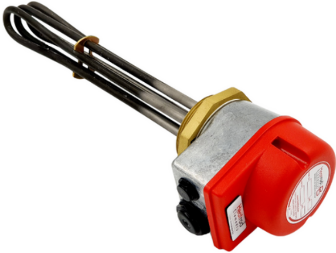
HR Light Industrial Immersion Heater