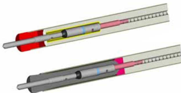
Tubular element with mounted thermal fuse.

In elements with permanently mounted fuse the thermal fuse is moulded with compound at the sealing operation and is not replaceable. When the thermal fuse has tripped, the element must be replaced.