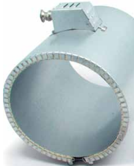
Suspended wire element