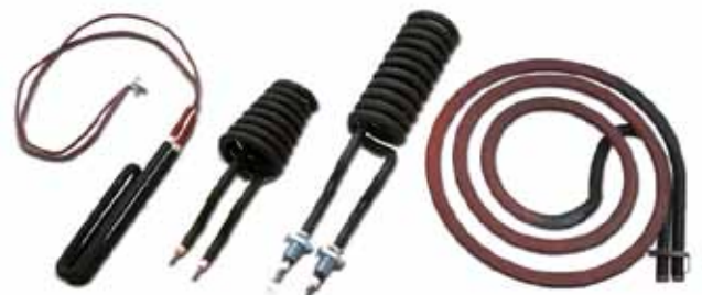
Example of product design