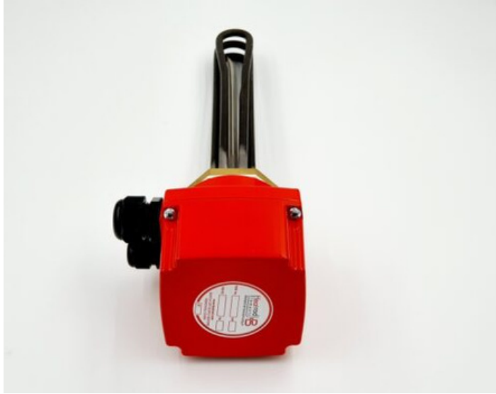
HRZi Heavy Duty Industrial Titanium Immersion Heater